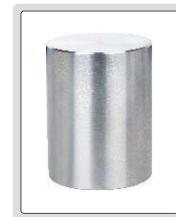
4kg weight block (optional) for ISH-S30D