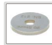
calibration block (included)